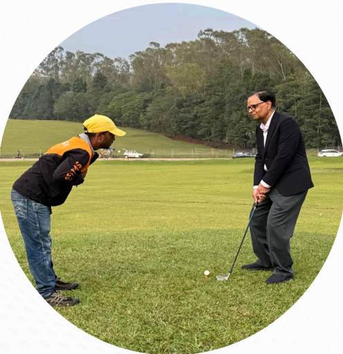
Dr. Arvind Panagariya Chairman of the 16th Finance Commission of India